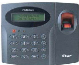
The FINGER006 is IDTECK's fingerprint-recognition proximity card reader with a keypad and no controller functions.